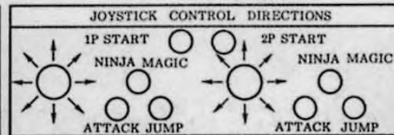
( B TYPE )