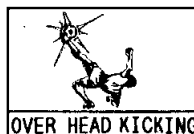
OVER HEAD KICKING

IT CHANGES DEPENDING OF THE TURNING DIRECTION OF THE JOY- STICK! MAKE SURE OF THE OTHER SHOOTING BY YOURSELF!!