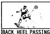
BACK HEEL PASSING

PRESS THE B-BUTTON IN FRONT OF AN OPPONENT!!